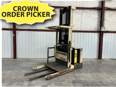
CROWN ORDER PICKER