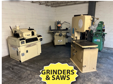
GRINDERS & SAWS