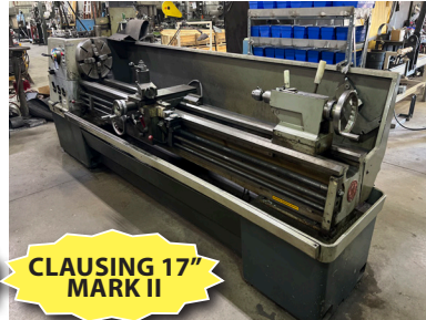
CLAUSING 17" MARK II