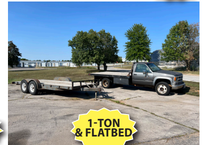
1-TON & FLATBED